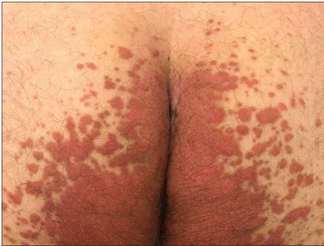
Figure 1: Butterfly-shaped hyperkeratotic erythematous plaque, bilaterally and symmetrically situated on the buttocks