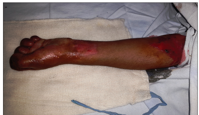
Figure 2a: Intraoperative image showing mitten-like deformity of the left hand