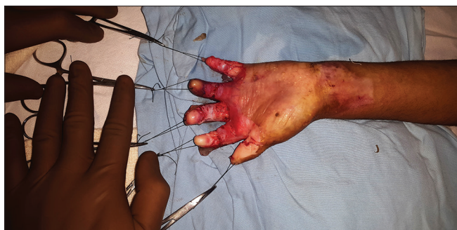
Figure 2b: Degloving, release of pseudosyndactyly and application of stay sutures