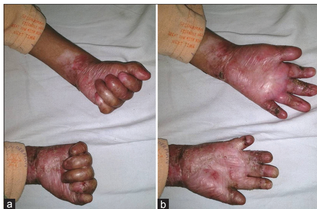
Figure 3: (a and b) Postoperative images 1 year after both surgeries showing full range of movements of both the hands after second surgery