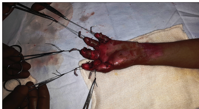
Figure 2c: Immobilization with no. 1 Kirschner wires and raw areas covered with full thickness skin graft