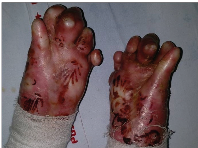
Figure 1: Preoperative image showing mitten like deformity of both the hands

Systematic analysis of the whole exome data revealed a compound heterozygous mutation p.R2777* and p.G1667E in the COL7A1 gene (reported elsewhere as novel variants). The variants were verified by capillary sequencing in the family.