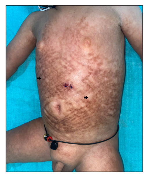
Figure 1b: Sclerodermoid changes in reticulate pattern along with mottled hyperpigmentation on the abdomen. Pebble-like outpouchings of fat on the abdominal wall (black arrows).

Sclerodermoid changes in progeria initially (6 to 12 months) start as swollen and thick skin over the abdomen and proximal