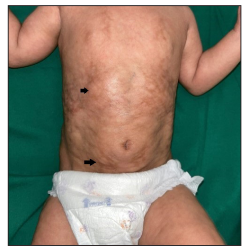
Figure 3: Case 2 showing sclerodermoid skin changes, mottled hyperpigmentation and fat outpouchings (black arrows) on the abdomen.

limbs which later (18 months) become sclerodermatous and bound down. As the disease progresses (around 2 years), the binding down vanishes and the skin becomes thin, atrophic and dry, with/without scaling.<sup>1</sup> In a case series, the bilateral nipples and labium majus were spared during the initial sclerotic process, leading to a 'protuberant soft nipples and labium majus' which was labelled as 'protuberant bikini sign' (88.9%).<sup>4</sup> However, in our cases, we noticed characteristic reticulate sclerodermoid hyperpigmented skin changes with outpouching of fat in uninvolved sclerotic areas giving a 'plastic bubble wrap' appearance.