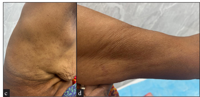
Figure 1c,d: Complete resolution of papules at 8-weeks of baricitinib.