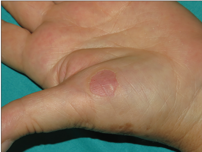
Figure 1: Circumscribed acral hypokeratosis: depressed pink plaque with well-defined borders