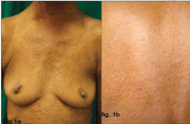
Figure 1: Erythematous plaques on the trunk and upper extremities of the patient after cyclophosphamide

Complete blood count, renal and liver function tests, electrolytes and autoantibody screen were normal with the exception of an elevated neutrophil count ( 12.10 \times 10^9/L ). Skin biopsy taken from one of the lesions showed a polymorphous inflammatory reaction within and around some eccrine sweat ducts, consisting of many neutrophils and a few lymphocytes without red blood cells extravasation [Figure 2].