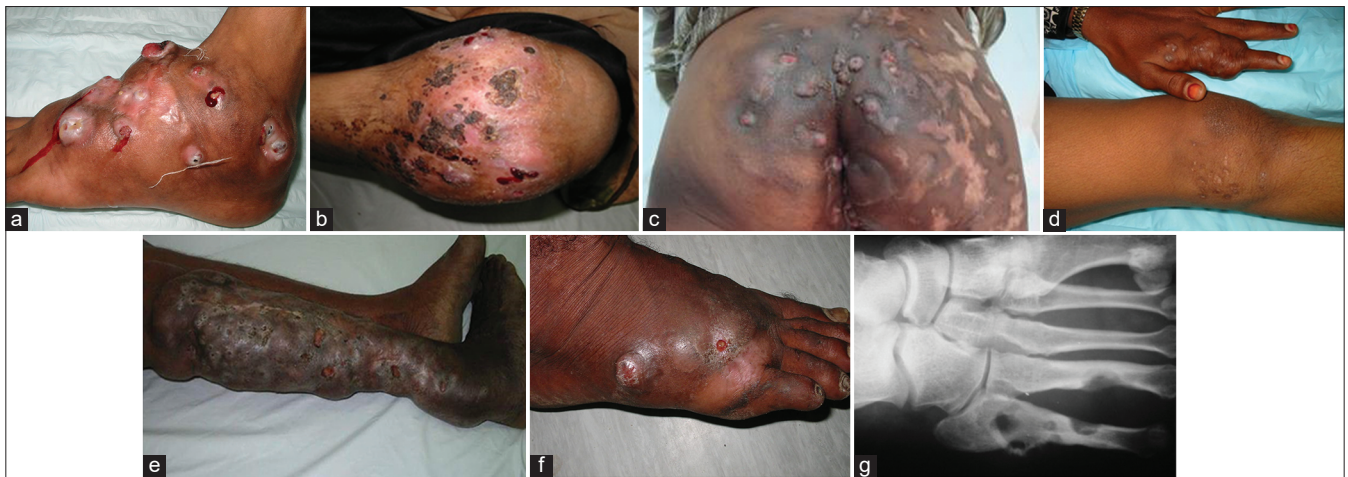
Figure 2: Eumycetoma caused by Madurella mycetomatis involving (a) foot, (b) knee, (c) gluteal region, (d) knee and hand, (e) leg, (f) foot, (g) X-ray of same patient showing medium sized well defined cavities.