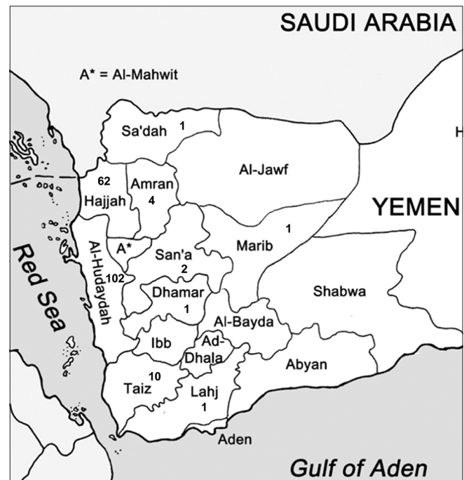
Figure 1: Map showing distribution of mycetoma in north-west Yemen

All patients were Yemeni nationals, residents of different governorates, as shown in Figure 1. Age of the patients