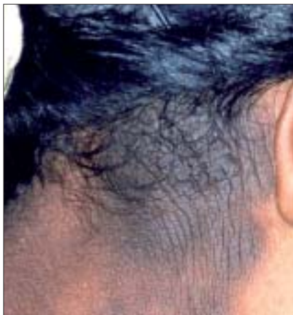
Figure 1: Hyperpigmented velvety plaque behind right ear

Nevoid AN has been grouped together with “syndromic AN” and “acral acanthotic anomaly” under the heading “other” causes of AN in a recent classification of AN. [2] Nevoid AN is said to have resemblance to ichthyosis hystrix and confluent reticulate papillomatosis, but in this case they could be clinically ruled out. Differentiation from linear epidermal nevus and from the hyperkeratotic type of seborrheic keratosis is more difficult, and it has even been suggested that this form of AN can be classified as a type