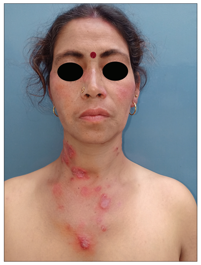
Figure 1b: Erythematous papules and plaques on the cheeks and bridge of nose