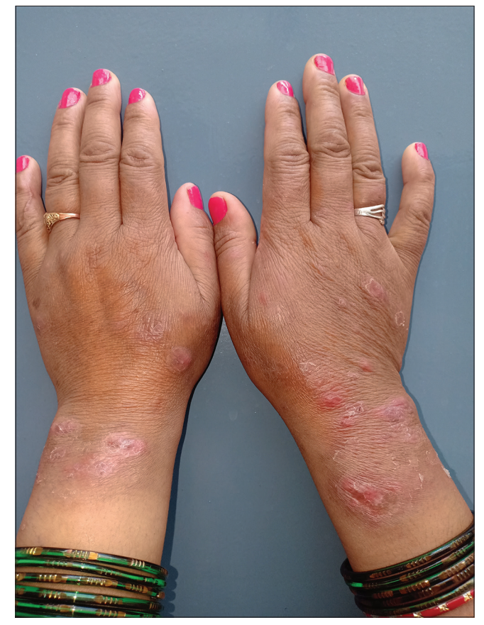
Figure 1c: Erythematous papules and plaques on dorsum of the hands