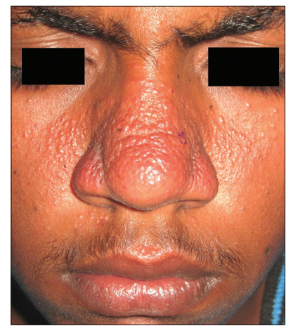
Figure 1: Erythematous papulovesicular lesions overlying a background of diffuse erythema and hyperhidrosis on the dorsum and alae of the nose, cheeks, glabella, and philtrum

The diagnosis of GRN is primarily clinical owing to its distinctive morphology. Clinical differential diagnoses include eccrine hidrocystoma and inflammatory or photosensitive dermatoses such as rosacea, perioral dermatitis, and lupus erythematosus. Multiple eccrine hidrocystoma of the Robinson-type simulate GRN clinically with the presence of multiple translucent, dome-shaped papules on the periorbital and malar