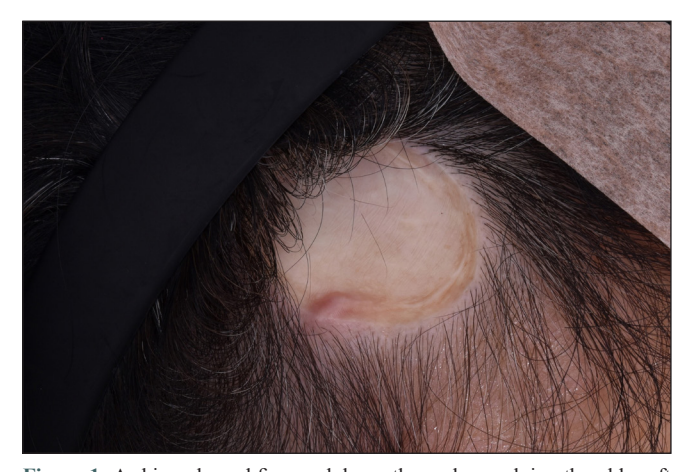
Figure 1: A skin-coloured firm nodule on the scalp overlying the old graft site.

In the case of skin metastasis with an unknown primary site, it is important to consider a wide-range of differential diagnoses.<sup>2</sup> There are a few reported cases of metastatic adenocarcinoma in old scars.<sup>3</sup> Among them, cutaneous metastasis from colonic adenocarcinoma in an old operative