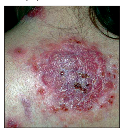
Figure 2: Infiltrated plaques on the upper back

erythrocyte sedimentation rate of 84 mm at the end of one hour. Serological tests were negative for syphilis, hepatitis B and C and human immunodeficiency virus (HIV). Skin biopsy showed hyperkeratosis, focal parakeratosis and irregular acanthosis of the epidermis. There was a dense cellular infiltrate, grossly nodular, in the entire dermis [Figures 3-4]. The results of the periodic acid-Schiff, Ziehl-Neelsen and Warthin-Starry stains were all negative. Cell-marker studies showed a heterogeneous population of cells without any phenotypic changes.