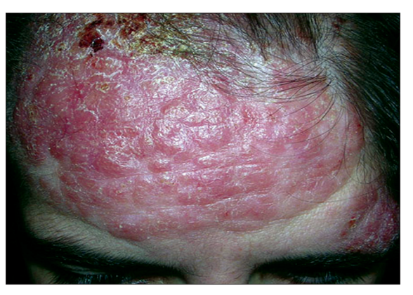
Figure 1: Infiltrated plaques on the forehead

A 31 year-old woman, previously healthy, presented a four-month history of enlarging plaques on the face and back without any constitutional complaints. She referred to one unprotected heterosexual contact but denied any past history of sexually transmitted infections. Physical examination revealed multiple, tumid, nontender erythemato-violaceous, slightly scaly, flat-topped plaques, distributed over her forehead [Figure 1], left cheek, right oral commissure and back [Figure 2]. Palms, soles, oral and genital mucosa were all free of lesions. There was no enlargement of lymph nodes, liver or spleen and the remaining physical examination was normal. Routine blood tests revealed an