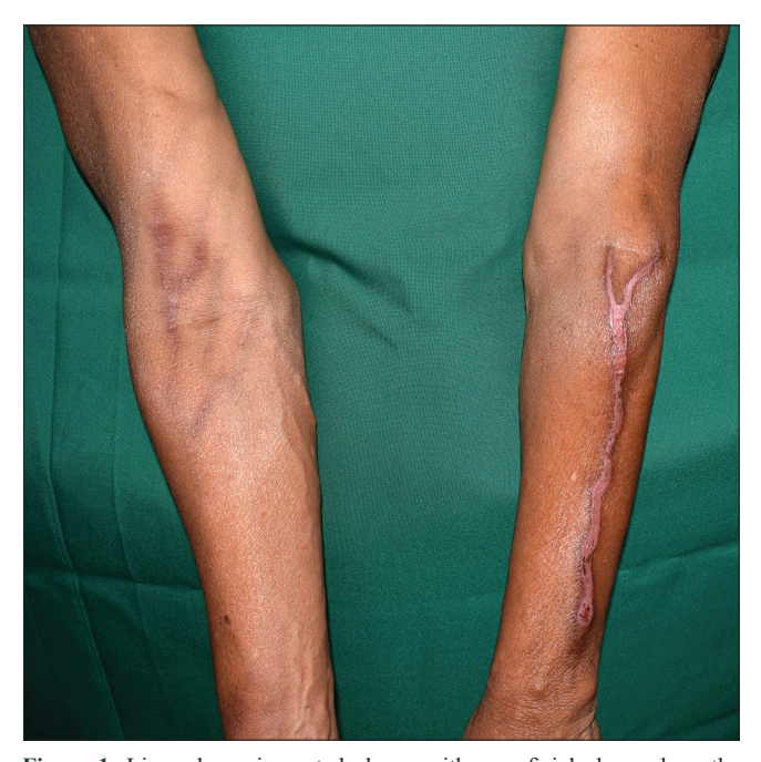
Figure 1: Linear hypopigmented plaque with superficial ulcers along the course of vein on left forearm (chemotherapy administered through a vein on contralateral right cubital fossa). Note the supraventine hyperpigmentation on the right cubital fossa, probably representing postinflammatory sequelae of an earlier chemotherapy recall reaction

over his left forearm, through which he had received the previous chemotherapy cycle 2 weeks ago. There was no prior history suggestive of a drug extravasation reaction at this site. On examination, there was a thin hypopigmented supravenous linear plaque with superficial ulceration over the left forearm and hyperpigmentation over the right cubital fossa [Figure 1]. The lesions resolved with a topical corticosteroid—antibiotic combination in a few days. The patient consulted us again after the fifth chemotherapy cycle, for burning pain and dusky erythema over the dorsa of both hands along the veins used for the previous (fourth) chemotherapy administration [Figure 2]. The fifth chemotherapy cycle was given through a vein on dorsum of the right hand, but distant from the site of current