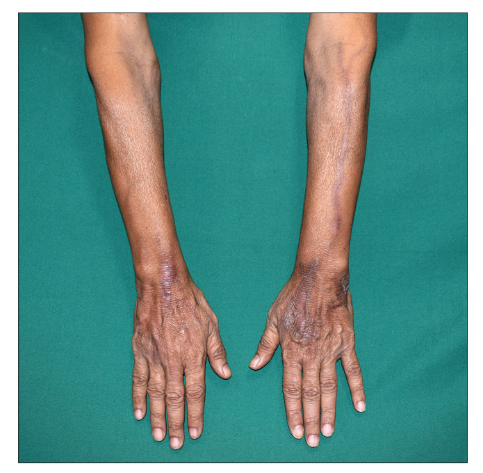
Figure 2: Bilateral dorsa of the hands showing dusky erythema and scaling over the veins through which the patient received his previous chemotherapy cycle. Note the previous recall reaction on the left forearm has subsided with hyperpigmentation

How to cite this article: Taneja N, Agarwal S, Gupta V. An unusual case of recurrent chemotherapy recall phenomenon. Indian J Dermatol Venereol Leprol 2021;87:263-5.