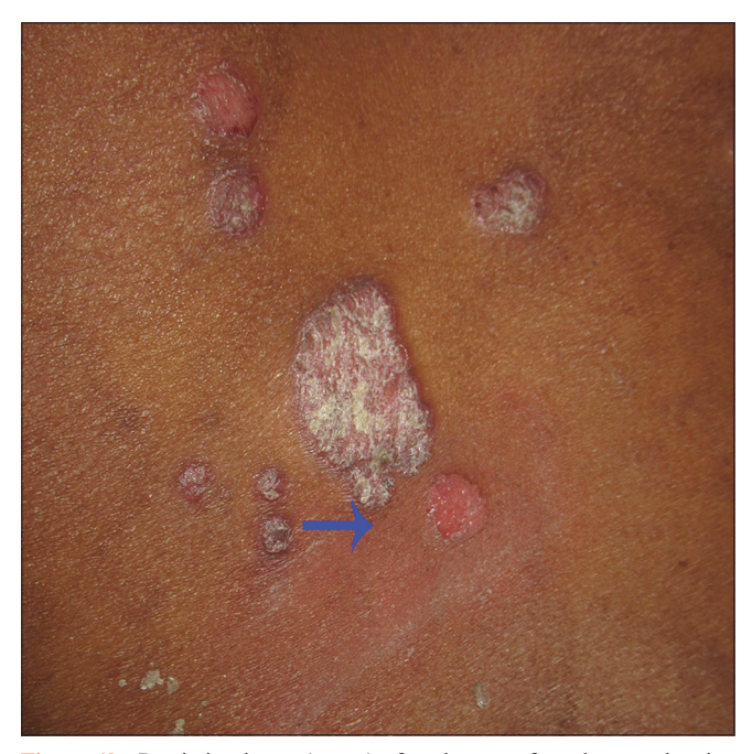
Figure 1b: Psoriatic plaque (arrow) after the use of sandpaper, showing complete absence of the scales without bleeding points

How to cite this article: Behera B, Dash S, Palit A. Sandpaper: An easy and effective tool to get rid of scales during the dermoscopic examination in plaque psoriasis. Indian J Dermatol Venereol Leprol 2021;87:599-600.