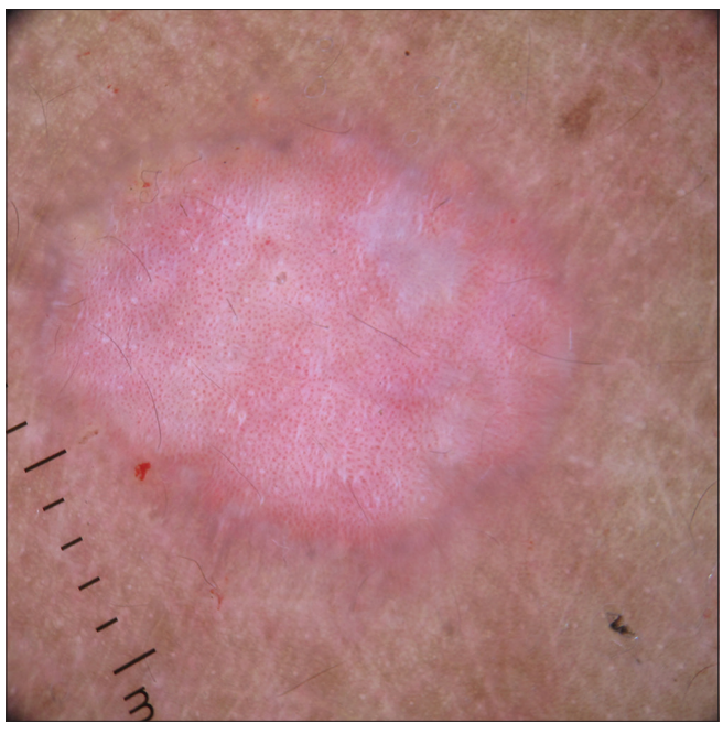
Figure 1c: Dermoscopic image of the plaque demonstrating regularly distributed dotted vessels on a pinkish background (Dermlite DL4, ×10)

examination of scales, both its color and distribution, is also important to arrive at a diagnosis. However, scales should be removed when hyperkeratotic lesions are present on the palms and soles or to visualize underlying dermoscopic features.