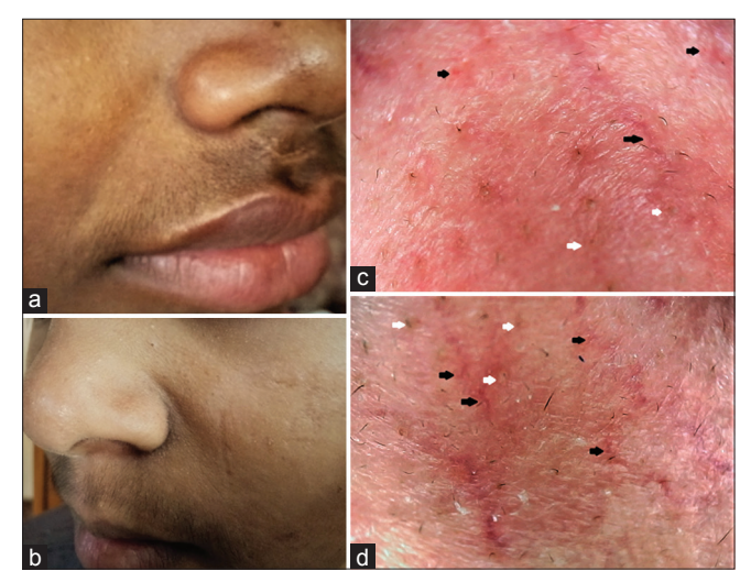
Figure 1: (a) Clinical photograph of a healthy young male showing mild reddish-brown pigmentation along the right alar groove without facial seborrheic dermatitis (b) Clinical photograph of a young male displaying velvety brown-colored pigmentation along the left alar groove along with presence of multiple plugged facial pores and open comedones (c) Dermoscopic image corresponding to Figure 1a revealsdiffuse faint erythema, out-of-focus telangiectasias, linear and arborizing vessels (black arrows), plugged pores (white arrows), scattered brown globules and minimal white scaling (Escope, videodermoscope, ×20, semi-polarized mode) (d) Dermoscopic image corresponding to Figure 1b reveals diffuse faint erythema, out-of-focus telangiectasias, linear and arborizing vessels (black arrows), plugged pores (white arrows), scattered brown globules and minimal white scaling (Escope, videodermoscope, ×20, semi-polarized mode)

hyperpigmentation has been reported only recently in an Egyptian study of 35 patients.<sup>7</sup> A simple dermoscopic comparison of the labiomental crease with and without stretching the skin would have been instrumental in solving this paradox