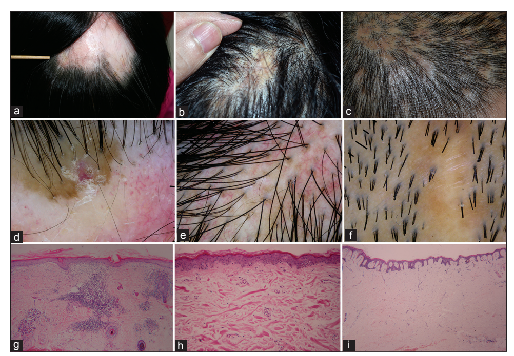
Figure 1: Global view (a-c), dermoscopy (d-f) and pathological features (g-i) of discoid lupus erythematosus, lichen planopilaris, classic pseudopelade of brocq