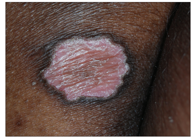
Figure 1: Classical solitary plaque of porokeratosis of Mibelli with central atrophy and peripheral keratoticrim

The first case of porokeratosis localized to the genitalia was described by Helfman and Poulos.<sup>42</sup> Since then, numerous cases have been reported, and this is now proposed to be a distinct clinical entity.<sup>43,44</sup> Lesions start as erythematous papules which progress to plaques, nodules or ulcers.<sup>45,46</sup> Various presentations of genital porokeratosis have been observed:<sup>47,48</sup>