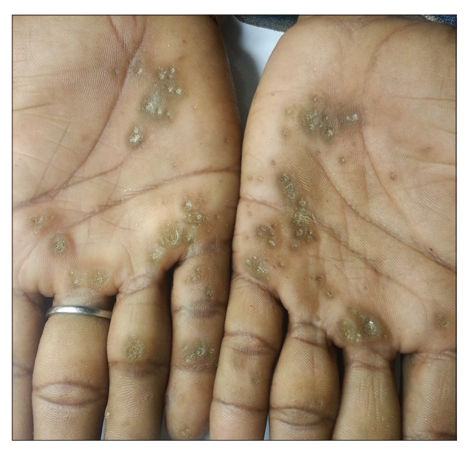
Figure 5: Punctate porokeratosis of palms