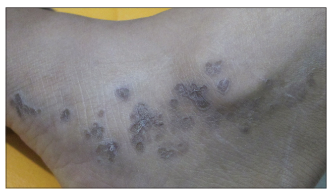
Figure 4: Linear porokeratosis on the foot and ankle

porokeratosis too has been reported to undergo malignant transformation.<sup>71-73</sup>