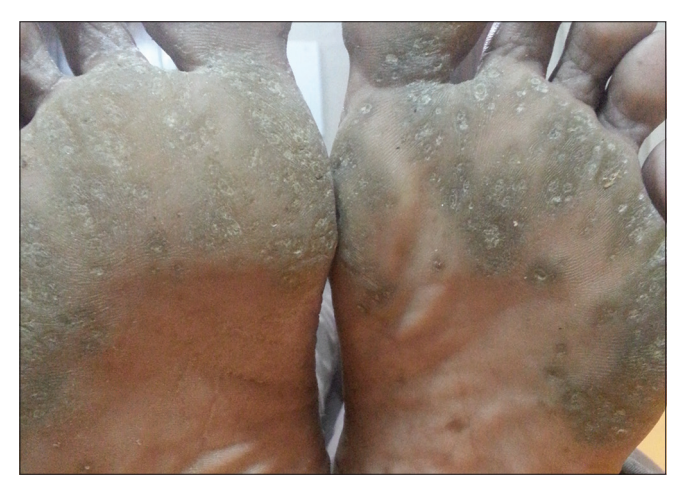
Figure 6: Punctate porokeratosis of soles