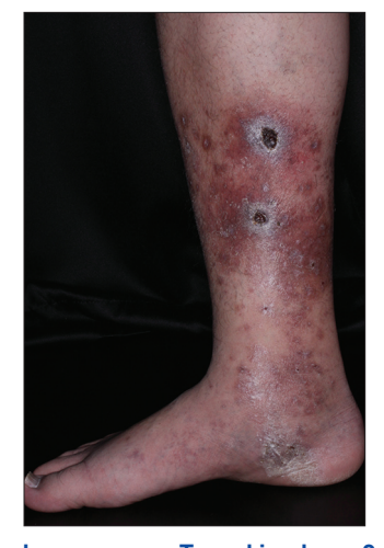
Figure 1: Clinical appearance. Two skin ulcers 2 cm in size with erythema on the right inner leg

Physical examination revealed symmetrical scaly erythema on the both legs with extensive edema [Figure 1]. Two skin ulcers 20 mm in size were found within the erythema on the inner surface of the right leg [Figure 1]. In addition, extensively dilated epigastric veins were shown on the abdomen [Figure 2]. Neither livedo nor varix was recognized on the both legs. Laboratory tests revealed decreased activated protein C (58%, normal range 64-146) and protein C antigen levels (45%, normal range 70-150). The results of other coagulation tests including