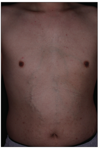
Figure 2: Multiple dilated subcutaneous veins in the abdomen