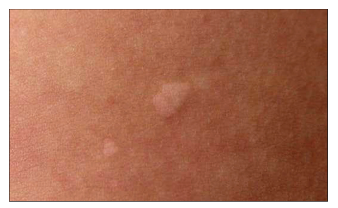
Figure 1c: Close up view of the lesions over the abdomen

the epidermis. Additional staining for CD1a, confirmed them to be immature dendritic cells.