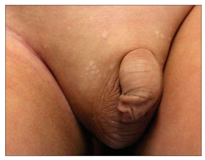
Figure 1b: Multiple,discrete, hypopigmented, macules and papules ranging in size from 2 to 5 mm over the abdomen and groins

Clear cell papulosis is a recently identified entity, characterized by female predominance, racial predilection for Asians and genetic predisposition as evidenced by reports of cases in several siblings.<sup>1-4</sup> It usually undergoes spontaneous regression after growth; making adult cases rare.<sup>1,2</sup> The pathophysiology of clear cell papulosis is still unknown, but Kim et al. have suggested that the clear cells of clear cell papulosis may have originated from eccrine secretory cells,<sup>3</sup> as these cells are stained with IKH-4, carcinoembryonic antigen and CAM 5.2, but not with lysozyme. Histopathologically, these clear