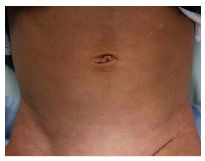
Figure 1a: Multiple,discrete, hypopigmented, macules and papules ranging in size from 2 to 5 mm over the abdomen and groins

A17-month-old boy presented with multiple hypopigmented, discrete, round-to-oval maculopapules on the groin and abdomen [Figure 1] which were initially seen at birth and have been gradually increasing in number and size with age. A skin biopsy revealed mild acanthosis, hyperkeratosis and the occasional presence of benign-appearing pagetoid clear cells having abundant clear cytoplasm with pale, round-to-oval nuclei along the basal layer of the epidermis [Figure 2] which were slightly larger than those of keratinocytes and showed indistinct nucleoli. There were several S100 positive basal melanocytes; however Fontana-Masson staining confirmed reduced/absent melanization. We performed immune histochemical staining to exclude vitiligo, [Figure 3]. The clear cells stained positive for D-PAS, cytokeratin7, carcinoembryonic antigen and epithelial membrane antigen and showed relatively decreased positivity for Melan-A and HMB-45 and negative for S100 protein. Interestingly, there was a prominent increase in the number of S100 protein-positive dendritic cells in