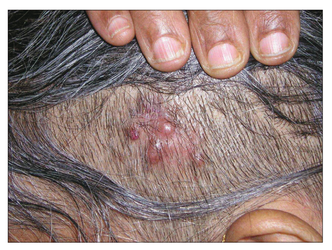
Figure 1: Erythematous papules, some eroded and crusted on the left frontoparietal scalp