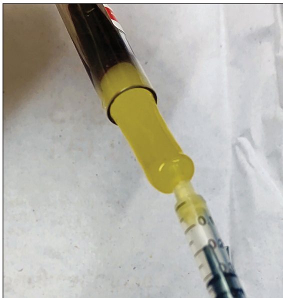
Figure 1: Tuberculin syringe used to pull out the fibrin plug from the test tube.

To address this issue, we propose extracting the fibrin plug from the tube with a one-ml tuberculin syringe. Blood is collected in a sterile test tube and spun for 10 minutes in a centrifuge at 3000 revolutions per minute (RPM). When platelet-rich fibrin is ready, a one-ml tuberculin syringe without a needle is introduced into the test tube, and once in contact with the fibrin plug, suction is applied on the syringe and it is withdrawn from the tube and placed over the wound [Figure 1]. Because a suction mechanism with a syringe is used, the entire platelet-rich fibrin plug comes out quickly and without deformation [Figure 2 and Video 1]. This procedure can simplify and expedite the entire process.