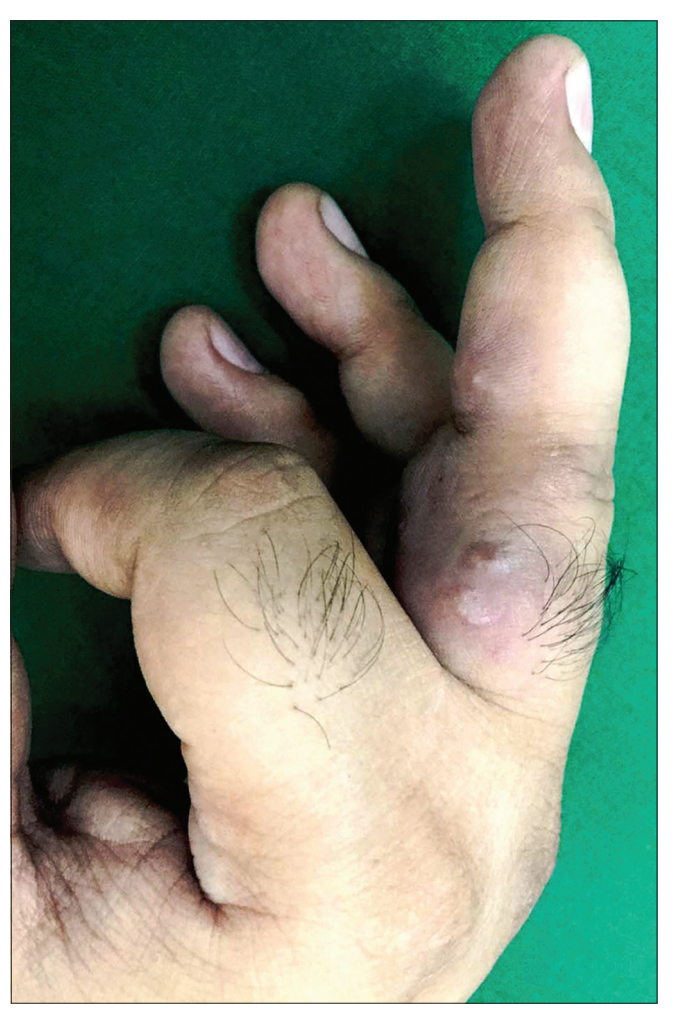
Figure 2: Close-up view showing erythematous to plum-colored indurated plaque with overlying two small vesicles on the proximal and middle phalanges of the third digit of the right hand

Some cases of eosinophilia associated with tumor necrosis factor-α inhibitors have been reported before.<sup>3</sup> Wells syndrome-like lesions have been described at the injection site of etanercept<sup>4</sup> and adalimumab<sup>5</sup> as local reaction to the drug, but not away from the injection site as observed