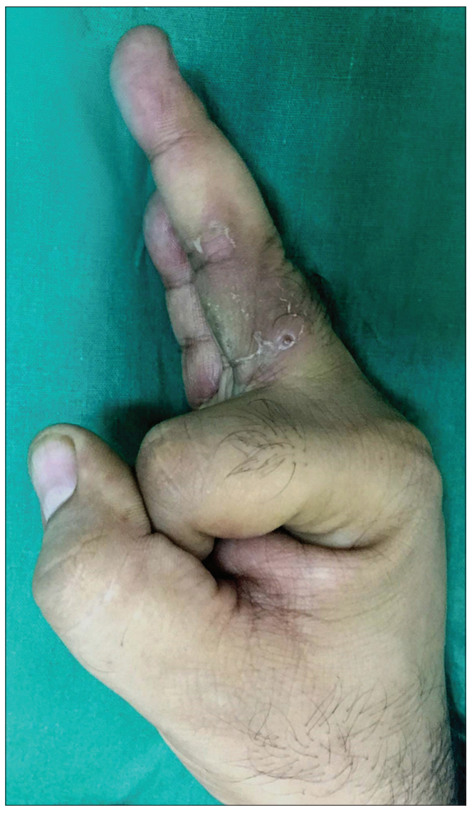
Figure 6: Improvement in edema with desquamation over the lesions 6 weeks after starting prednisolone