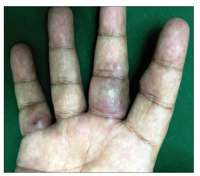
Figure 1: Erythematous to plum-colored indurated plaques on the volar aspect of the third and fifth digits of the right hand

Wells syndrome presents with sudden onset, single or multiple, erythematous, indurated or urticarial plaques which resolve without scarring over 2–8 weeks. Clinical variants of Wells syndrome include plaque type, annular