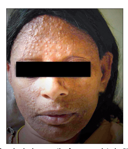
Figure 1: Papular lesions on the face associated with universal alopecia. Patient is wearing a wig

Miller et al.[4] reported a patient with Vitamin D