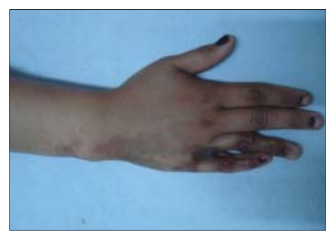
Figure 1: Clinical photograph showing linear scleroderma with partial anonychia

Some patients with linear scleroderma may be at some risk for developing systemic collagen-vascular diseases.<sup>[3]</sup> The present patient is being followedup closely due to her equivocal ANA result. Among different variants of morphea, there is only one report of anonychia in a patient with pansclerotic morphea of childhood.<sup>[4]</sup> The same patient appears to have been reported again as part of a case series<sup>[5]</sup> because several details (age, weight, laboratory investigations, treatment and outcome) of these two cases match. No