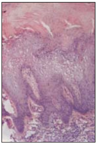
Figure 2: Photomicrograph of skin biopsy specimen showing marked parakeratosis and acanthosis. There is vacuolization of cells in the upper third of the stratum malpighi and the dermis shows vasodilatation and chronic inflammation (Hematoxylin & Eosin x 100)