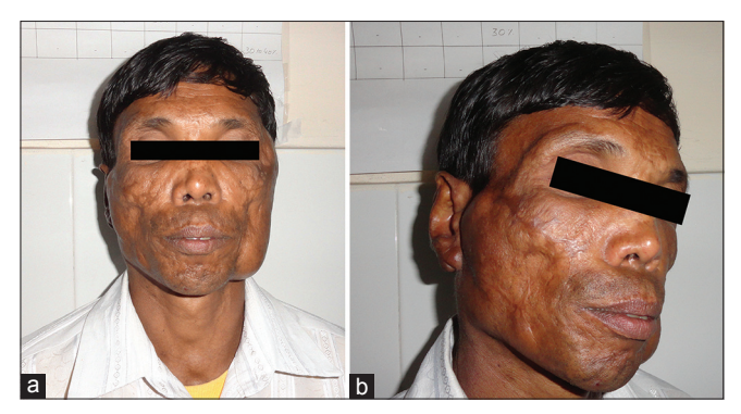
Figure 1: (a and b) Skin coloured nodular swelling over cheeks extending up to mandibular area with atrophic scars on face and nasal deformity

General physical and systemic examinations were normal.There were multiple nodules of varying size (5-9 cm) distributed over the left side of face, right cheek and ear lobe. The nodules were smooth, soft, mobile and non-tender with normal overlying skin [Figure 1a and b]. Mucosal surfaces were normal. He had bilateral cervical lymphadenopathy with discrete, soft to firm, mobile and non-tender lymph nodes.