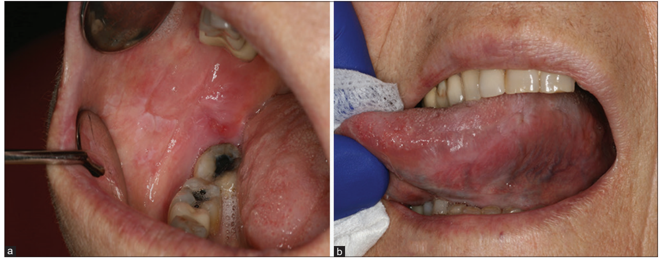
Figure 3: Significant improvement of oral lichenoid lesions after 1-month therapy with topical clobetasol (a and b)

The only emergent oral mucosal toxicity associated with crizotinib is dysgeusia, which affects approximately 20% of patients treated with this drug. <sup>3</sup> Nonspecific stomatitis has been only reported sporadically in a subset of patients treated with this drug. Our case, as well as that recently reported by Ho and Chen, shows that a subset of eruptions induced by crizotinib may be due to a lichenoid reaction, either with skin or oral mucosal involvement.<sup>2</sup> However,