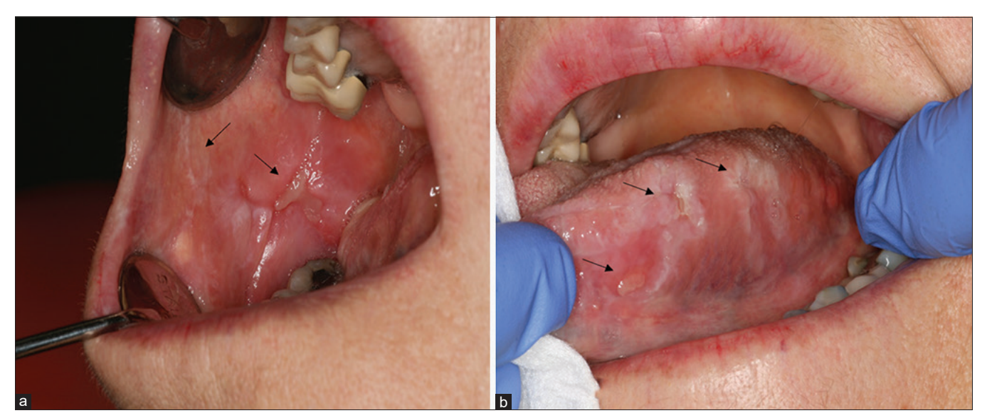
Figure 1: Buccal mucosa (a) and lateral aspect of the tongue (b) with visible reticular white streaks (arrow) and ulcerative lesions (arrow)

Oral adverse events induced by new targeted anticancer therapies remain poorly characterized and are frequently described using nonspecific terminology (e.g. "stomatitis" or "mucositis"). However, targeted-therapy-related oral toxicities often display very characteristic changes that differ significantly from mucositis induced by chemotherapeutic agents [Table 1]. This mainly includes mechanistic target of rapamycin kinase (mTOR) inhibitor-associated stomatitis (mIAS), stomatitis, and benign migratory glossitis associated with multitargeted kinase inhibitors of the vascular endothelial growth factor (VEGF) and platelet-derived growth factor (PDGF) receptors, oral aphthous-like lesions induced by epidermal growth factor receptor (EGFR) inhibitors, hyperpigmentation of the palate with imatinib, ibrutinib-related stomatitis, or hyperkeratotic lesions with B-rapidly accelerated fibrosarcoma (BRAF) inhibitors in monotherapy.3 Moreover, oral lichenoid reactions have also been observed with a range of targeted therapies, notably with