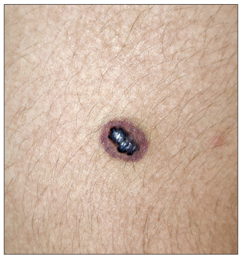
Figure 1: A single violaceus purple nodule with surrounding ecchymotic ring on left arm.

A 21-year-old healthy medical student presented with an asymptomatic bluish-purple vascular lesion surrounded by a purple-red ring on his left arm for 3 years. There was history of multiple spontaneous resolution and reappearances of this lesion. It measured 3 \times 1.5 cm and was located on the extensor aspect of the left arm [Figure 1].