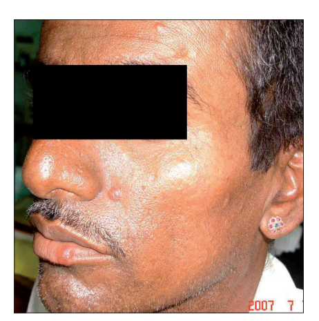
Figure 2: Nodules over lower lip, naso-labial fold and forehead in case 1