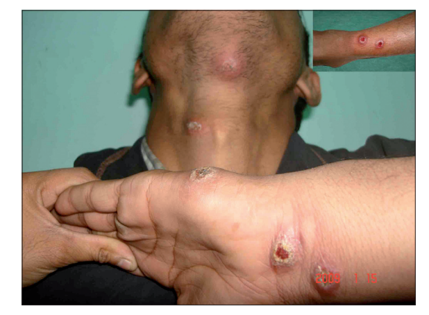
Figure 4: Plaques over left hand and neck in case 2. Two lesions developed over right leg (Inset) even after treatment

A 28-year-old laborer presented with single asymptomatic, non-tender lesion for the last 6 months