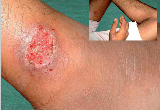
Figure 5: Single ulcerated plaque over right leg in case 3. Three lesions developed (Inset) even after intralesional SSG treatment

multiple bites of sandfly in an immuno-competent person but usually occurs secondary to an underlying deficiency in cellular immunity. In the past, several authors have reported CL in known cases of HIV/AIDS. <sup>[5,7,8]</sup> Chaudhary et al, <sup>[9]</sup> simultaneously diagnosed a case of co-infection. Our cases were having typical papulonodulo-ulcerative lesions of CL without any systemic symptoms; we diagnosed them as cases of localized or disseminated CL which is endemic in this region. When they did not respond to treatment satisfactorily and even new lesions appeared, we thought of HIV infection and found them to be positive. CL usually responds well to systemic or intralesional antimonials and relapses are not frequent in immuno-competent patients.<sup>[3]</sup> In co-infected patients also, antimonial treatment is effective and resistance is very rarely reported.<sup>[11]</sup> Niamba et al ,<sup>[4]</sup> and Rosatelli et al ,<sup>[8]</sup> reported successful treatment with antimonials in co-infected patients of HIV with L. infantum and Leishmania braziliensis, respectively. Unresponsiveness to SSG in our cases may be due to difference in species of Leishmania or host immunological factors. The co-