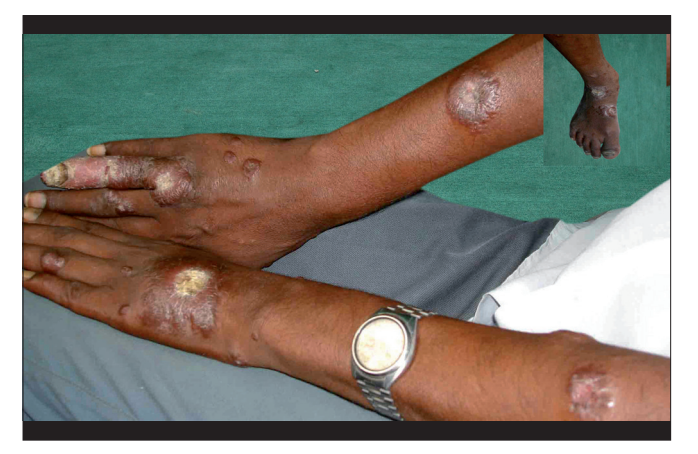
Figure 1: Nodules and plaques of cutaneous leishmaniasis over forearms, hands and right foot (Inset) in HIV positive patient (case 1)