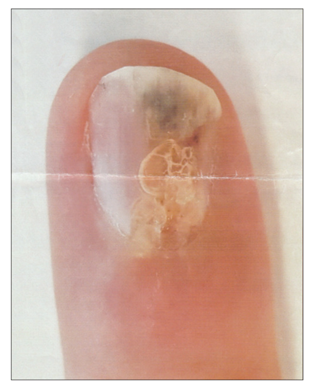
Figure 1a: The patient displayed an involvement of the fifth finger, featuring chronic paronychia with onychodystrophy and a discoloration of the nail lamina.

A diagnostic biopsy of both skin and nail was performed. Both the biopsies revealed findings consistent with