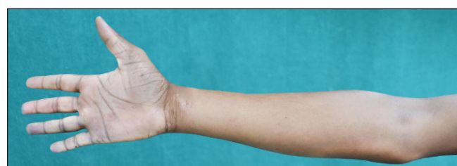
Figure 1b: Disappearance of the purpuric lesions but persistence of bluish discolouration of the fourth and fifth digits