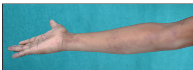
Figure 1a: Multiple discrete purpuric lesions, with swelling on the medial aspect of the forearm along with bluish discolouration of the fourth and fifth digits

In our case, intra-arterial cannulation occurred while attempting IM injection (Diclofenac) on the medial aspect of the