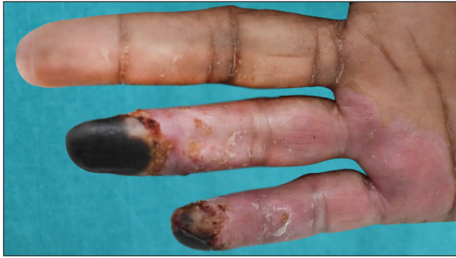
Figure 1c: Palmar aspect of the hand showing dry gangrene on tips of the fourth and fifth digits with a clear line of demarcation