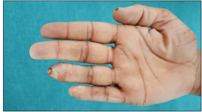
Figure 1d: Digits after healing with scar tissue