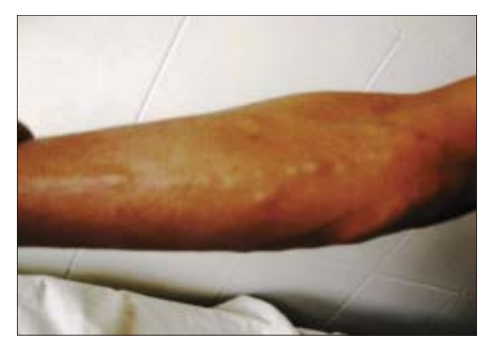
Figure 1: Thickenned cutaneous nerve with nodules