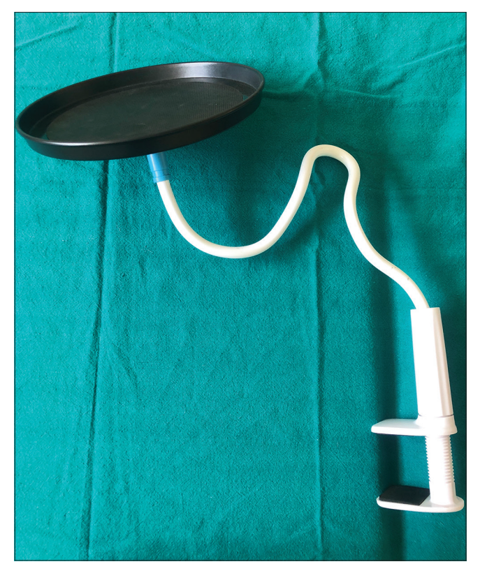
Figure 3: Using the food tray in a procedure

Department of Dermatology, Aggarwal Hospital, Jagadhri, 'Department of Dermatology, Maharishi Markandeshwar Institute of Medical Sciences and Research, MMDU, Ambala, Haryana, India