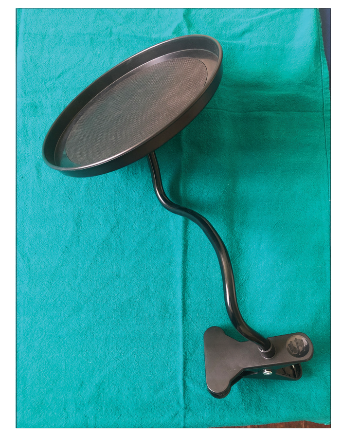
Figure 1: A car food tray

How to cite this article: Aggarwal K, Gujrathi AV, Yadav A, Gupta S. Using a car food tray in dermatosurgical procedure for placing instruments. Indian J Dermatol Venereol Leprol 2023;89:154-5.