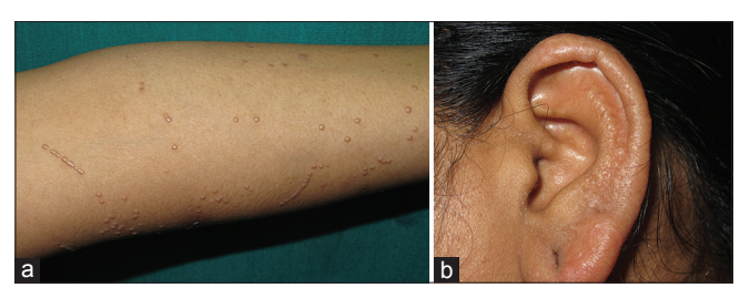
Figure 1: (a) Multiple, skin colored, discrete, 1–3 mm papules with Koebner phenomenon. (b) Diffuse thickening of ear lobe