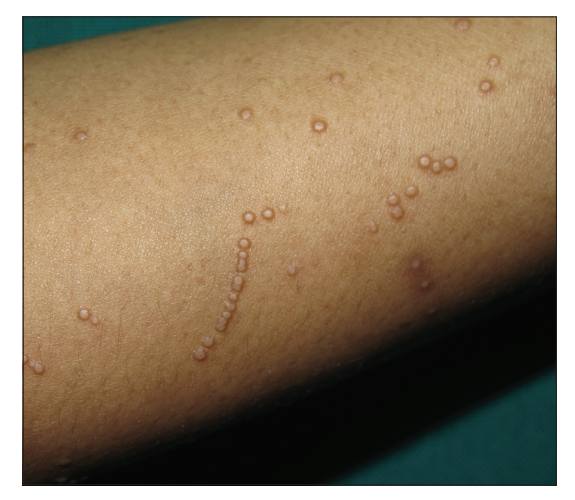
Figure 2: Koebner phenomenon