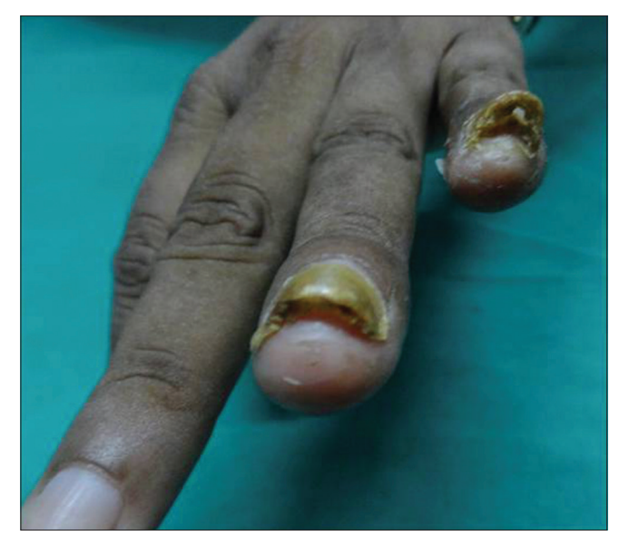
Figure 2a: Subungual warts: pretreatment