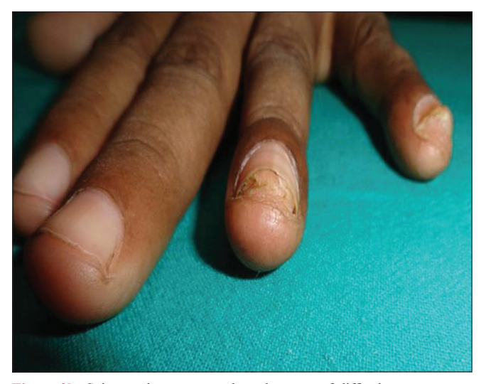
Figure 2b: Subungual warts: complete clearance of difficult-to-treat warts with three doses of Bacillus Calmette Guerin (at 12 weeks of treatment)

Bacillus Calmette–Guerin immunization scar was present in 30.3% of patients in the Bacillus Calmette–Guerin group and in 51.9% in the tuberculin purified protein derivative group [Table 1]. Subgroup analysis with the presence of a Bacillus Calmette–Guerin immunization scar as the grouping variable showed no significant differences in the reduction of the number of warts between the two subgroups at all follow-ups in the Bacillus Calmette–Guerin group [Table 5]. A similar subgroup analysis in the tuberculin purified protein derivative group showed a significant difference of the number of warts at baseline itself (P = 0.029); analysis of