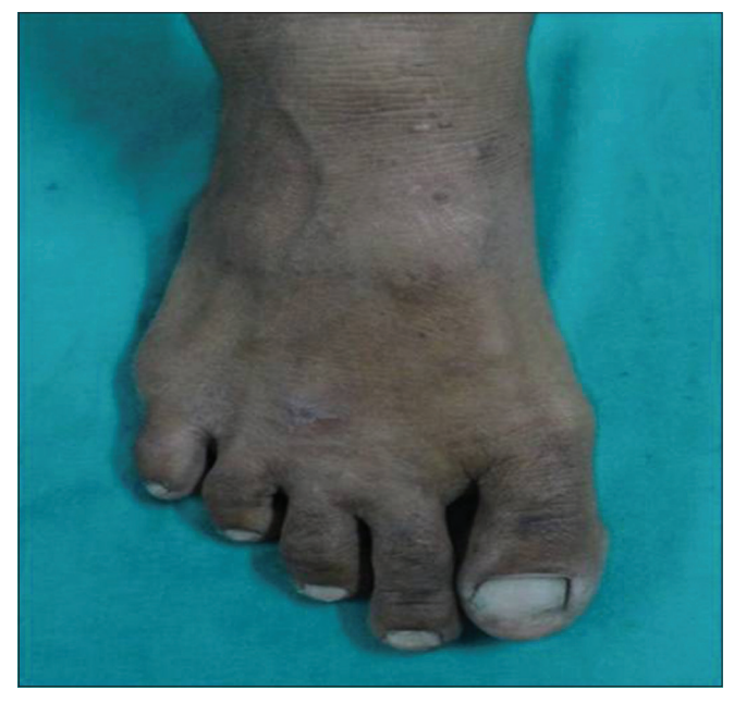
Figure 3b: Posttreatment photograph showing complete clearance of multiple warts (verucca plana) on foot with three doses of tuberculin purified protein derivative (at 12 weeks of treatment)

covariance with the baseline as covariate yielded no significant differences between these subgroups [Table 6].