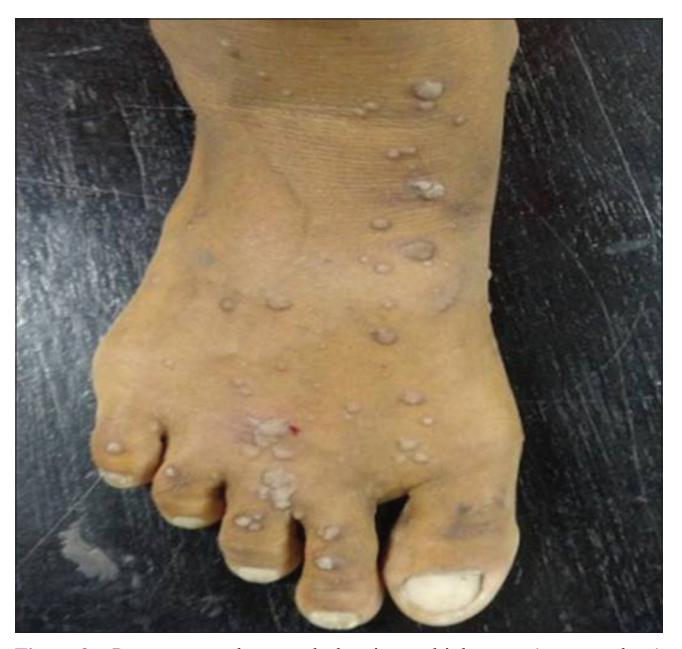
Figure 3a: Pretreatment photograph showing multiple warts (verucca plana) on foot

categories. Interestingly, complete responders had had significantly larger warts than had those who responded partially [Table 4]. No recurrences were seen in either of the two groups.