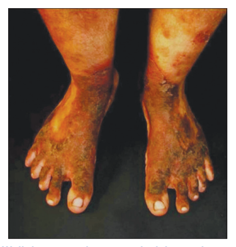
Figure 1: Well demarcated, symmetrical, hyperpigmented, scaly plaques with erythematous rim over dorsum of feet

The proposed hypotheses for zinc deficiency in