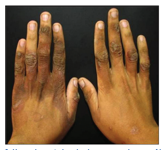
Figure 2: Hyperpigmented scaly plaques over dorsum of hands

How to cite this article: Topal AA, Dhurat RS, Nayak CS. Zinc responsive acrodermatitis in nephrotic syndrome: A rare presentation. Indian J Dermatol Venereol Leprol 2012;78:122-3.