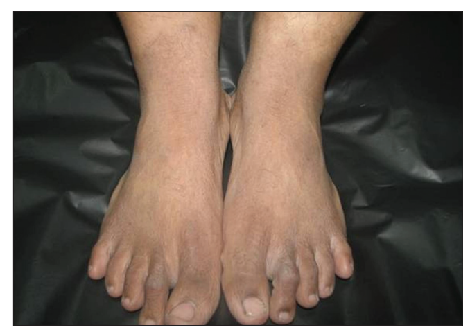
Figure 4: Complete clearance of lesions over the feet after zinc therapy

Although zinc deficiency has been reported in patients with nephrotic syndrome, the development of cutaneous signs of zinc deficiency in these patients is an uncommon occurrence; an extensive literature search revealing only one such case report. It is unclear why despite low serum zinc levels (mean value: 51.7\mu g/dl ) in NS, most patients are clinically asymptomatic. Perhaps, concomitant immunosuppression may prevent development of overt skin manifestations or perhaps zinc deficiency in these patients is never severe enough to produce symptoms. However, it is difficult to comment on severity of zinc deficiency based on serum zinc levels alone, since plasma zinc