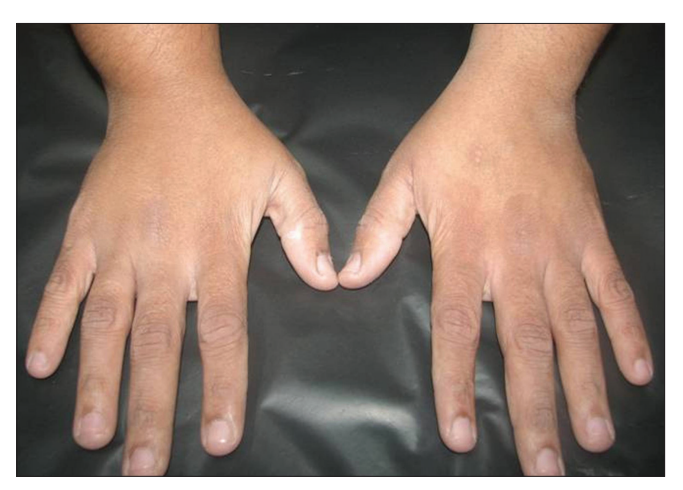
Figure 5: Complete clearance of lesions over hands after zinc therapy