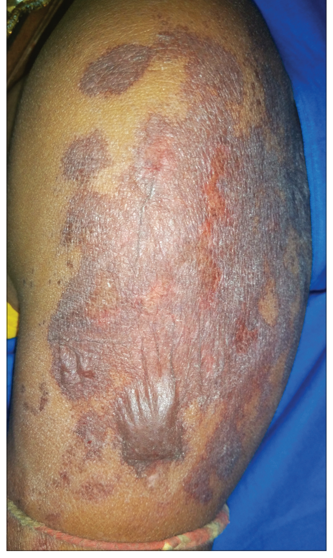
Figure 1b: A close-up view of left arm showing lesions of bullous fixed drug eruption