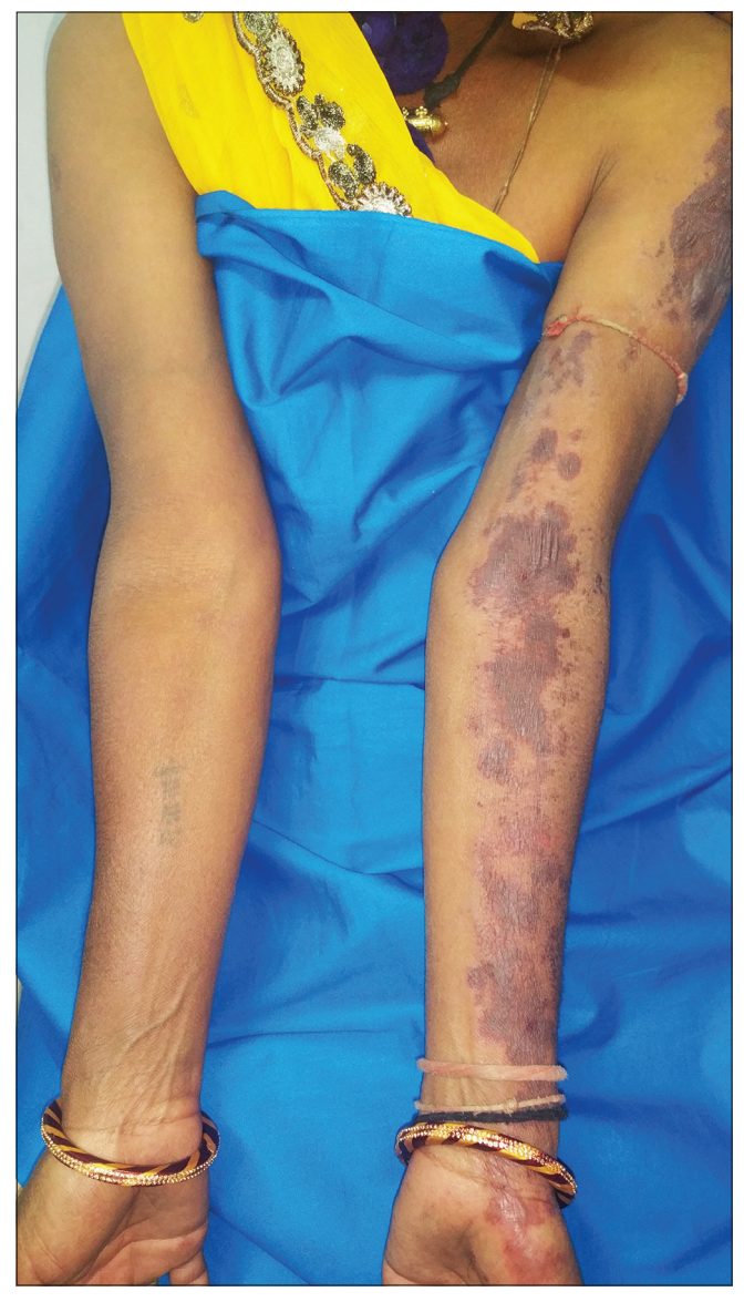
Figure 1a: Multiple well-defined hemorrhagic bullae and dusky erythematous to brownish discoloration over left shoulder, upper arm and hand