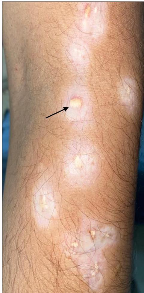
Figure 1a: Multiple atrophic, hypopigmented scars studded with yellowish to white papules (black arrow) in a linear distribution over right forearm

A 26-year-old male presented with multiple atrophic, hypopigmented scars studded with yellowish-to-white papules in a linear distribution over the right forearm [Figure 1a]. The lesions were initially itchy and elevated having started after a trauma 3 years ago. Most likely, those were hypertrophic scars. He was treated with multiple intralesional triamcinolone (40 mg/mL) injections over the individual scars at 1–3 month intervals, until 6 months back. The scars flattened, but hypopigmentation and papules appeared during the treatment course. Histopathology showed deposition of well-circumscribed pools of light basophilic acellular, finely granular to amorphous mucin-like material [Figure 1b] in the upper dermis. Angulated, crystal-like empty spaces with focal calcification were seen within the deposits [Figure 1c]. There was an absence of a prominent