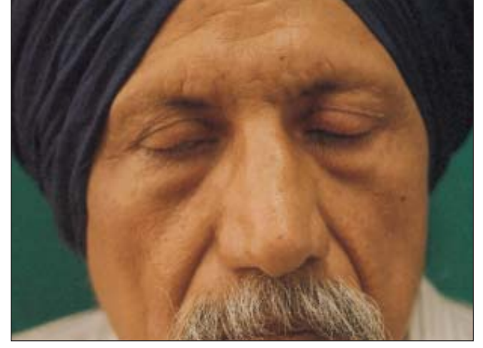
Figure 3: Complete clearance of lesions at 8 weeks' follow up