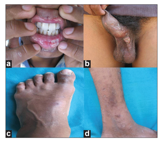
Figure 1: Clinical lesions: (a) Oral ulcer on lower lip; (b) scrotal ulcer; (c) solitary papulopustule on dorsum of foot; (d) lesions suggestive of superficial thrombophlebitis

prevent further thrombosis. He has been symptom free for the last 6 months of follow-up.