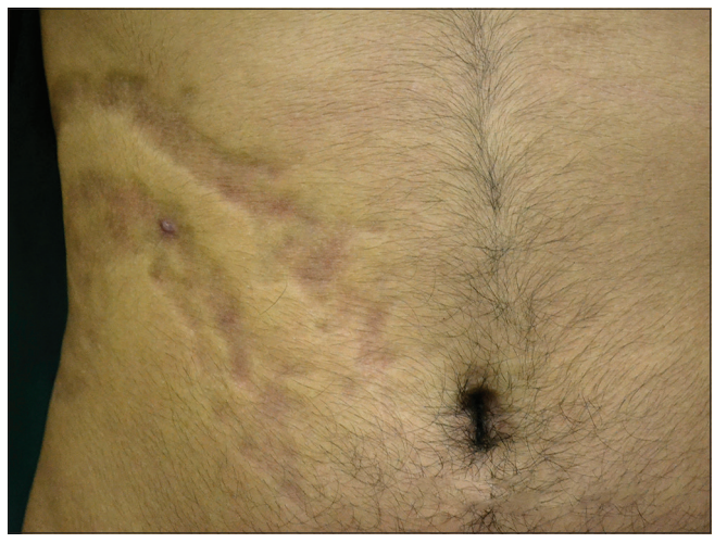
Figure 1a: Two parallel bands of atrophic, linear hyperpigmented plaques along Blaschko's lines, extending from the umbilicus to the right side of abdomen

Moulin first described linear atrophoderma of Moulin in 1992, as an acquired unilateral hyperpigmented atrophic band along Blaschko's lines.<sup>2</sup> Browne and Fisher reported a case with antecedent inflammation in a 16-year-old male and proposed that linear atrophoderma of Moulin may occasionally be preceded by an inflammatory stage that evolves into hyperpigmentation and atrophy.<sup>3</sup> Therefore they suggested that there are two variants of the same disease: an inflammatory and a non-inflammatory linear atrophoderma of Moulin. Later, Utikal et al. described two