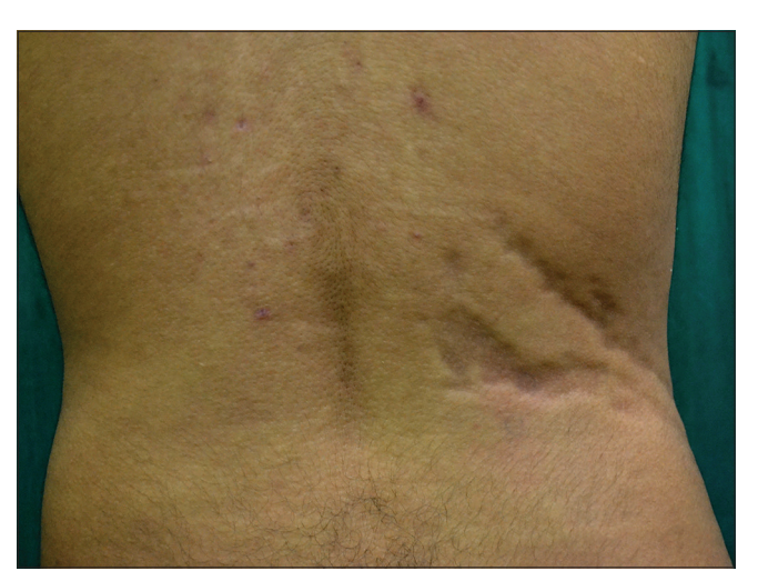
Figure 1b: Two parallel bands of atrophic, linear hyperpigmented plaques along Blaschko's lines, extending from the midline to the right side of back