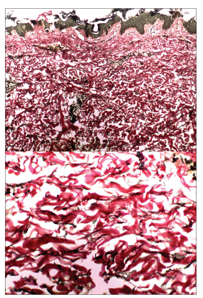
Figure 3: Verhoeff's Van Gieson stain normal (×400)

There is no proven effective treatment for linear atrophoderma of Moulin. Topical steroids and high-dose penicillin have been reported to be ineffective. Artola et al. described a patient whose lesions stabilized with oral potassium aminobenzoate 12 g/day. Wongkietkachorn et al. reported a case with partial response to topical calcipotriol. Zaouak et al. reported a case successfully treated with methotrexate.