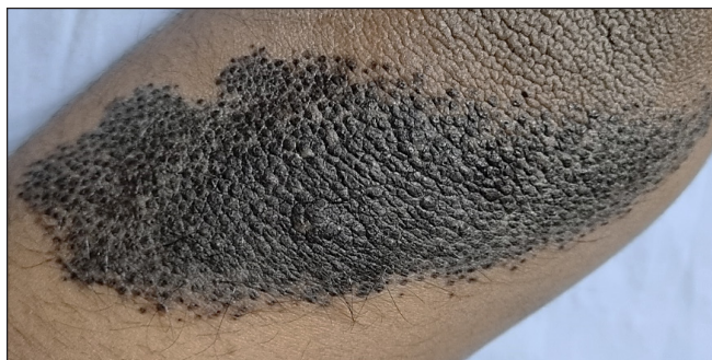
Figure 1: Grouped hyperpigmented papules forming a well-defined plaque