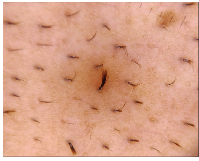
Figure 2: Trichoscopy (Illuco IDS-1100, Korea; ×10, polarized mode) revealing multiple short terminal hair emerging from a single hair canal

A 42-year-old male presented with complaints of persistent itching over back, of 3 years duration. Examination revealed an area of thick, short, prominent terminal hair over the interscapular region [Figure 1]. Trichoscopy revealed multiple easily extractable short hair of different lengths, emerging from a single hair canal, and enclosed in a common outer sheath [Figure 2]. Histological examination showed multiple hair shafts emerging from a single infundibulum, enclosed in a common outer root sheath and separated from each other by layers of inner root sheath. A diagnosis of pili multigemini was made. Treatment options include laser hair removal and electrolysis.