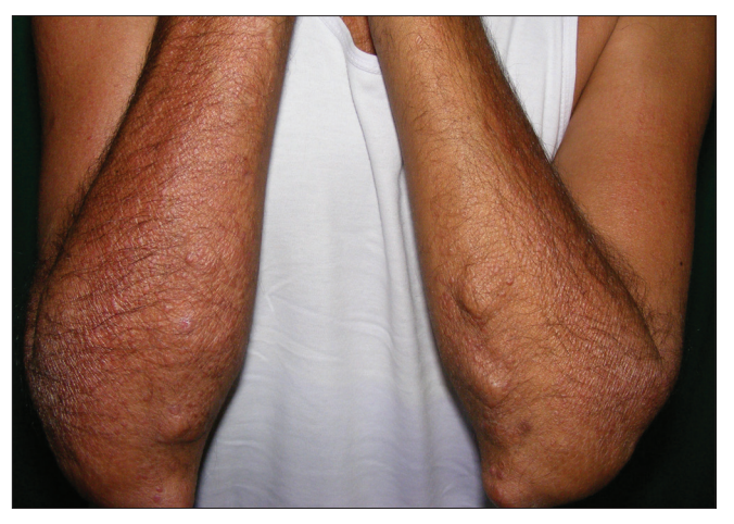
Figure 7: Post treatment photograph with significant redution in size and number of papulonodular lesions