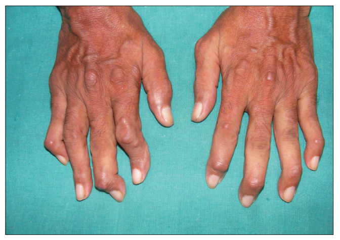
Figure 1: Flexion deformity of distal interphalangeal joints of both hands