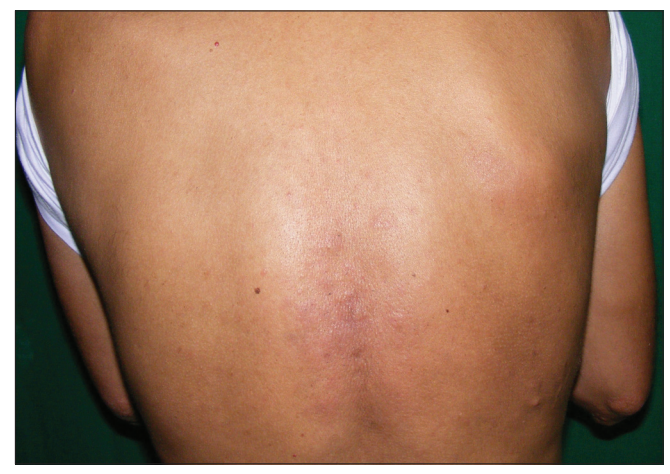
Figure 9: Plaque over the upper back has almost disappeared

Diagnosis is based on histological and immunological features of the proliferating histiocytes. On