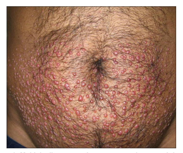
Figure 3: Multiple discrete erythematous papules over abdomen