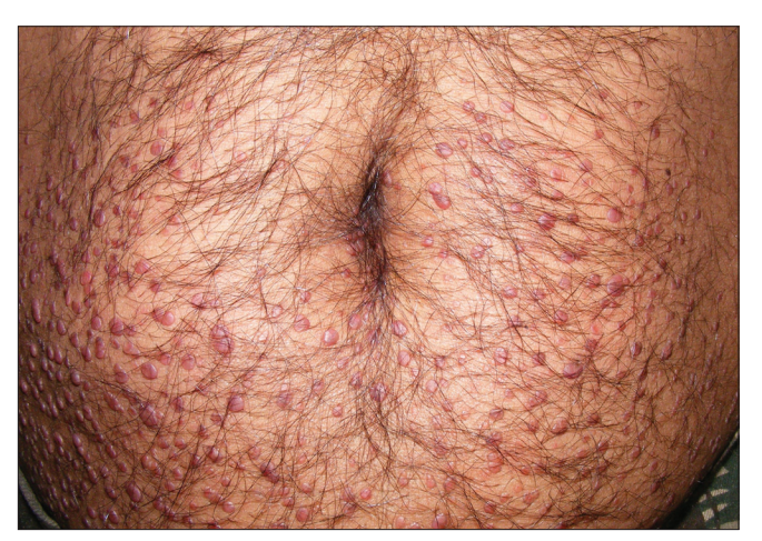
Figure 8: Post treatment photograph of lower abdomen with striking reduction in the number, size and erythema of lesions