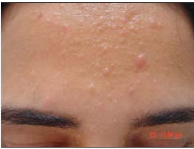
Figure 1: Facial trichoepitheliomas

In this patient, a number of large trichoepitheliomal lesions of the face and cylindromas of the scalp were finally excised; and because of the numerous lesions distributed throughout the face, she was subjected to continued treatment with carbon dioxide laser.