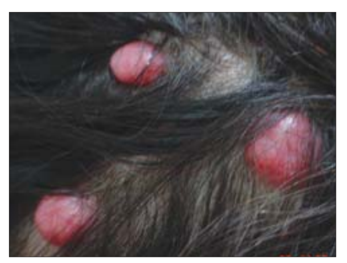
Figure 2: Scalp cylindromas

We have presented a case with BSS. This syndrome has an autosomal dominant mode of inheritance and tends to form numerous adnexal tumors, in particular trichoepithelioma, cylindroma, and occasionally spiradenoma, especially in the second or third decade of life. [1-4] To date, the cell-type specific origin of BSS is a topic of ongoing debate. For cylindroma and spiradenoma, both the apocrine and eccrine origins have been suggested, but the origin of follicular trichoepithelioma is not yet confirmed. [5] Some individuals may present with isolated trichoepithelioma or cylindroma, whereas others can have a combination of them in one tumor, as described by Honag Ly et al , [6] which suggests a common embryonic relationship between the follicles and the apocrine glands. Thus BSS represents a genetical disorder which affects the regulation of the folliculo-sebaceous apocrine unit.