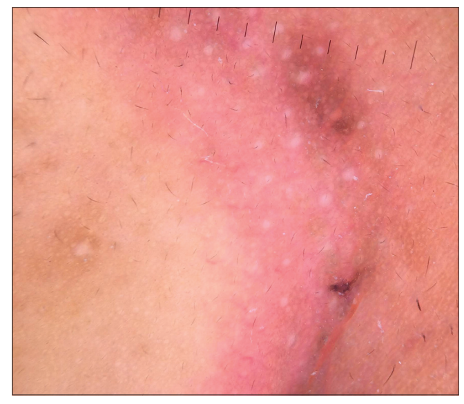
Figure 5b: Light pink erythema with linear vessels with hyperpigmented pseudonetwork at the margin in the nasolabial area (\times 10)