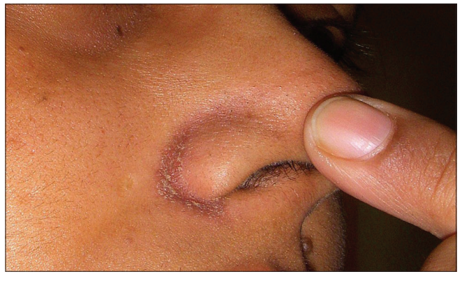
Figure 1: Lesion preceding localized facial darkening of the seborrheic areas with erythema and scaling present on the alar grooves

was more pronounced in darker individuals compared to those who have light skin [Figure 3].