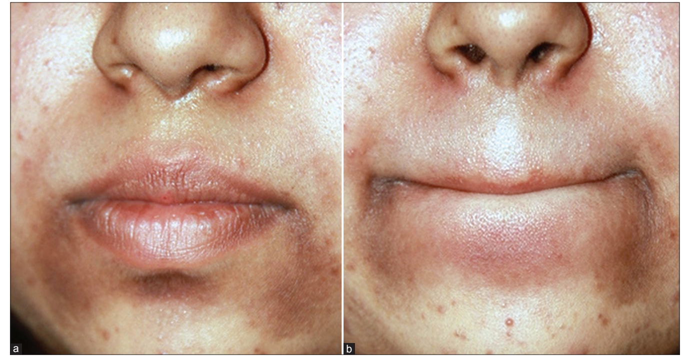
Figure 4: (a) Prominent darkening of the lower central area of the face, bilateral angles of the mouth and labiomental crease (b) Lightening of the the pigmentation after the patient stretches the affected skin by pursing the lips

Like seborrheic dermatitis elsewhere, this condition responds to topical steroids and topical calcineurin inhibitors. We treated these cases with tacrolimus ointment 0.1% or pimecrolimus 1% cream and emollients leading to resolution of inflammation, lightening and relief of burning. We did not use mild topical steroids due to their potential for abuse.<sup>8</sup> Tacrolimus ointment caused a burning sensation in some patients owing to a defective barrier function of the involved skin but the tolerance to the drug normalized as the