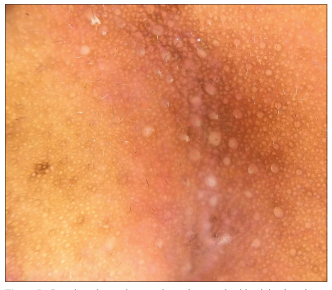
Figure 5c: Prominent hyperpigmented pseudonetwork with minimal erythema at the margins in the nasolabial area (\times 10)

erythema resolved. We found that the less irritant pimecrolimus was not as efficacious. Some patients reported a beneficial effect of treatment with ketoconazole cream. The response to these modalities and the lack of response to routine bleaching creams such as those containing hydroquinone, kojic acid, arbutin or combinations thereof may be another pointer to this being a form of seborrheic dermatitis. We advised all the patients to use mild sodium lauryl sulfate-free cleansers and facial cosmetics with no irritant tendency. In addition, the patients were counseled to avoid rubbing the area and use a non-irritating emollient. Explaining the shadow effect was comforting to the patients and helped in convincing them regarding the innocuous nature of the condition.