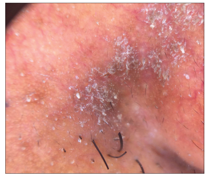
Figure 5a: Yellow scales with light pink background and linear and arborizing vessels in the nasolabial area (×10)