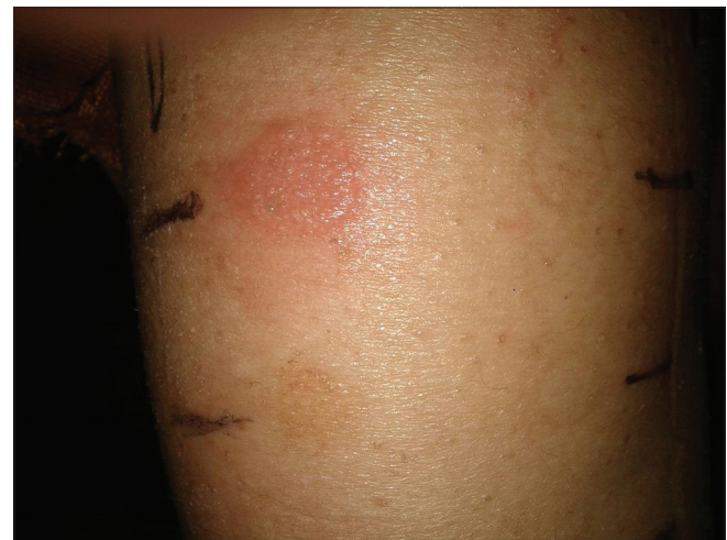
Figure 2: Preimplant positive (2+) reaction to nickel in a female patient who had history of itching and oozing while using artificial jewelry