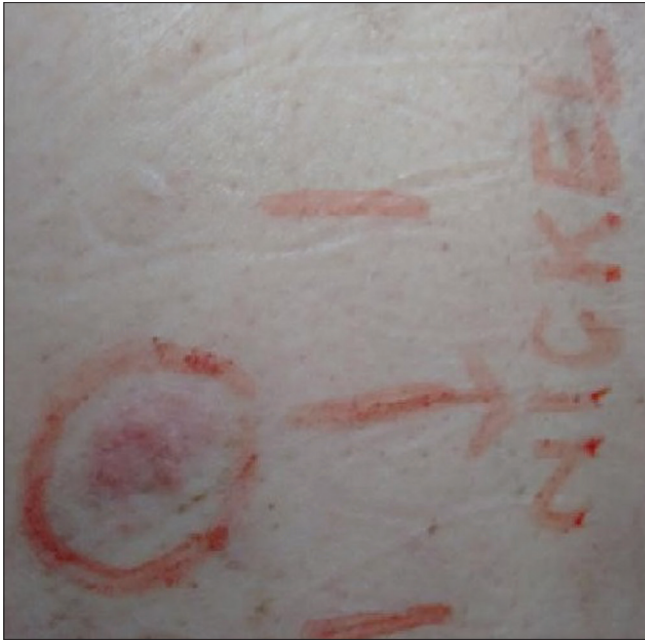
Figure 3: Postimplant positive reaction (1+) to nickel with erythema and infiltration at 96 hours. The patient tested negative to nickel in the preimplant test

less sensitive than the back as a site for patch testing. 11 This probably explains the lesser number of positive reactions observed by us.