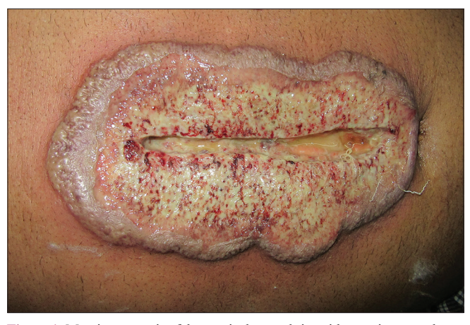
Figure 1: Massive necrosis of the surgical wound site with prominent erythema and edema suggesting the active nature of postsurgical pyoderma gangrenosum