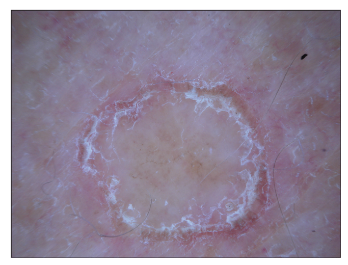
Figure 2b: Dermoscopy shows a thick scaling edge with rough scales and peeling, proceeding both inwardly and outwardly