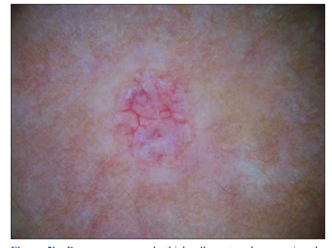
Figure 5b: Dermoscopy reveals thick adherent scales covering the plaque, both peripherally and centrally, whereas no direction of scaling is evident