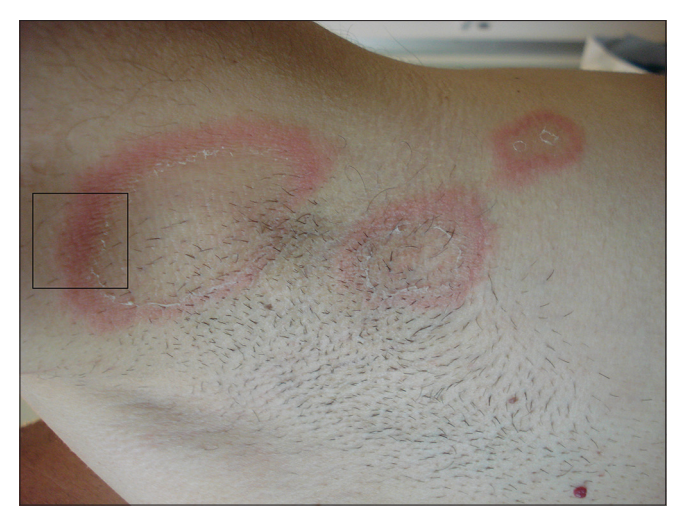
Figure 3a: Axillary lesion of erythema annulare centrifugum in a 43-year-old man