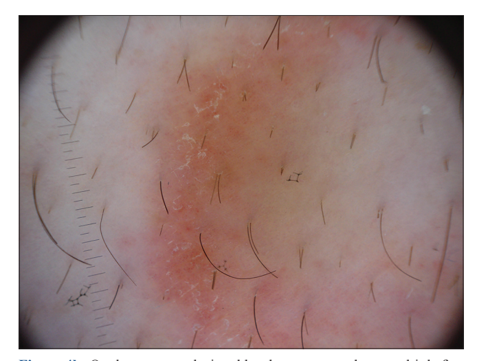
Figure 4b: On dermoscopy, lesional borders appear to have multiple fine scales with undefined direction of peeling