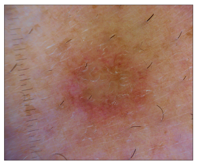
Figure 6b: Dermoscopy highlights non-specific diffuse scaling pattern all over the border with arborizing vessels homogeneously arranged

We underline that although dermoscopy is traditionally used for the diagnosis of skin tumors, it has also become increasingly useful as an adjunct in the clinical diagnosis of a variety of inflammatory and infectious skin, hair and scalp disorders.