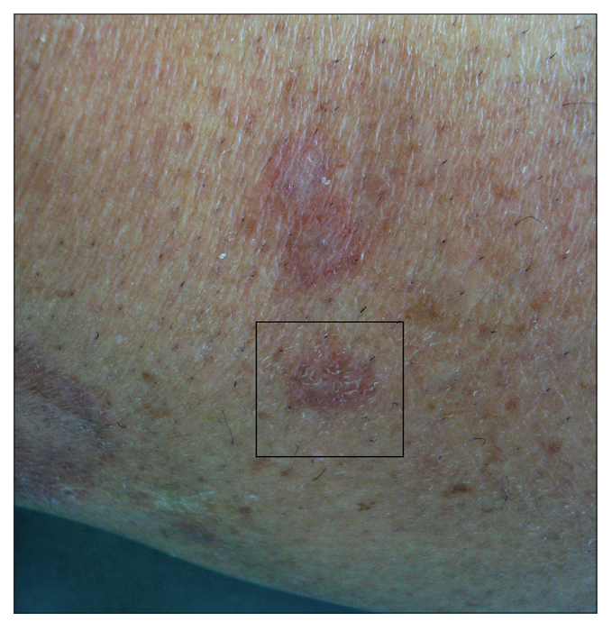
Figure 6a: Granuloma annulare lesions on the leg of a 51-year-old woman: multiple annular patches with fine scaling, erythematous raised border and pale center

scales [Figure 5a]. Dermoscopy highlights diffuse pink areas, arborizing vessels and irregular scales with no specific direction of peeling [Figure 5b].