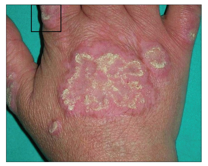
Figure 5a: Subacute cutaneous lupus erythematosus on the hand of a 57-year-old woman