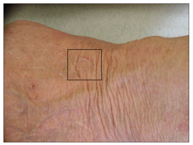
Figure 2a: Actinic porokeratosis lesion in a 75-year-old woman