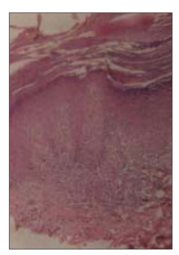
Figure 2: Acanthosis, hypergranulosis and compact orthokeratosis with vacuolar degeneration of basal cells and lymphocytic infiltrate (H and E, x100)

with pseudo-carcinomatous hyperplasia without any evidence of malignancy. However, these cases require a regular and vigilant follow-up. Our patient had a well-differentiated SCC with a size less than 2 cm and absence of overlying ulceration, which are indicators of a good prognosis and she has been doing well with the treatment given. Hence, careful vigilance of a longstanding LPH is necessary to allow early detection of a developing SCC.