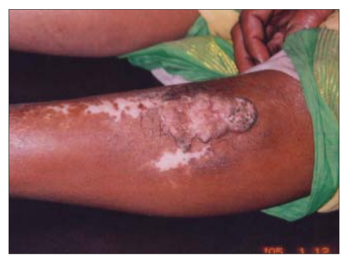
Figure 1: Hypertrophic plaque of LPH with an overlying exophytic growth